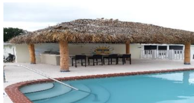
Tiki Hut Bar & Grill

SPREAD THE WORD, TELL A FRIEND WHY THEY SHOULD COME STAY WITH US.