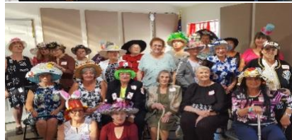
LOTS of Activities & Gatherings