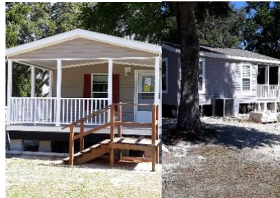
Beautiful New Homes