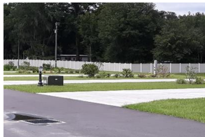
50 New Southside Super Sites