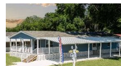
Nobility Home #MH-51 3/2 bath, Double Porch $159,999 Incl. all Furniture and Furnishings