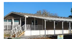
Nobility Home #MH-52 Single Porch, 2/2 bath $149,999 Incl. all Furniture and Furnishings Stop in or Call to Schedule a Tour of all our Homes